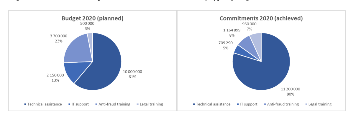
Figure 3: Hercule III budget and commitments in 2020 by type of eligible action

Figure 3 below provides a breakdown of the planned 2020 budget and commitments by type of action. The technical assistance actions as provided for in Regulation (EU) No 250/2014 encompass technical assistance grant activities and IT support (databases and IT tools). Training actions include the grant activities under the 'training, conferences and staff exchanges' and 'legal training and studies' calls for proposals, and procured conferences and specialised training. In 2020, the planned budget for technical assistance support represented 74.3% of the total and commitments represented 84.9%. These percentages exceed the minimum percentage of 70% for technical assistance stipulated in the Annex to the Regulation.