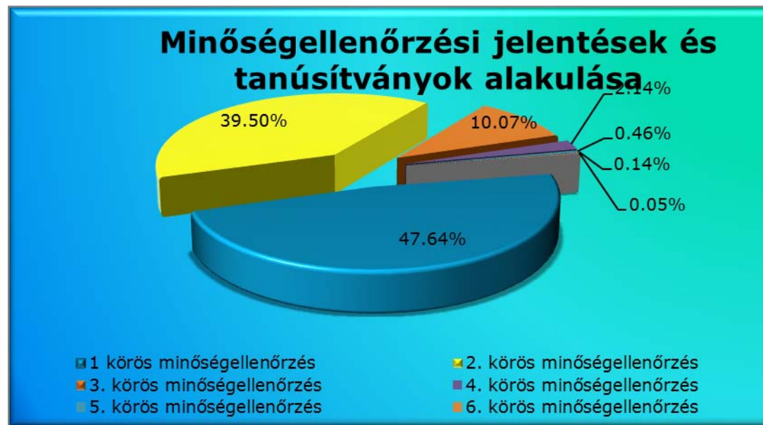
Minőségellenőrzési jelentések és tanúsítványok alakulása