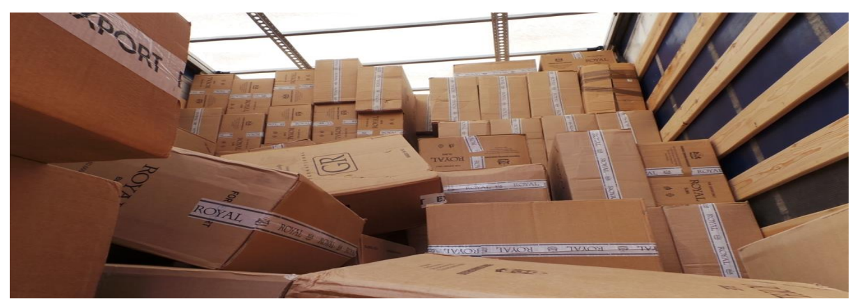
Greece: Zahra Case