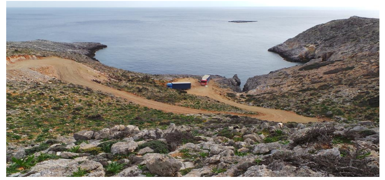
Greece: Zahra Case