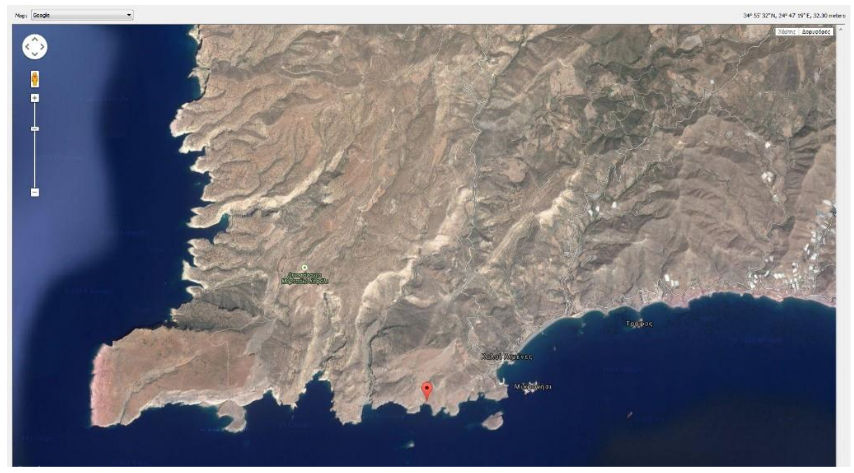
Greece: Zahra Case