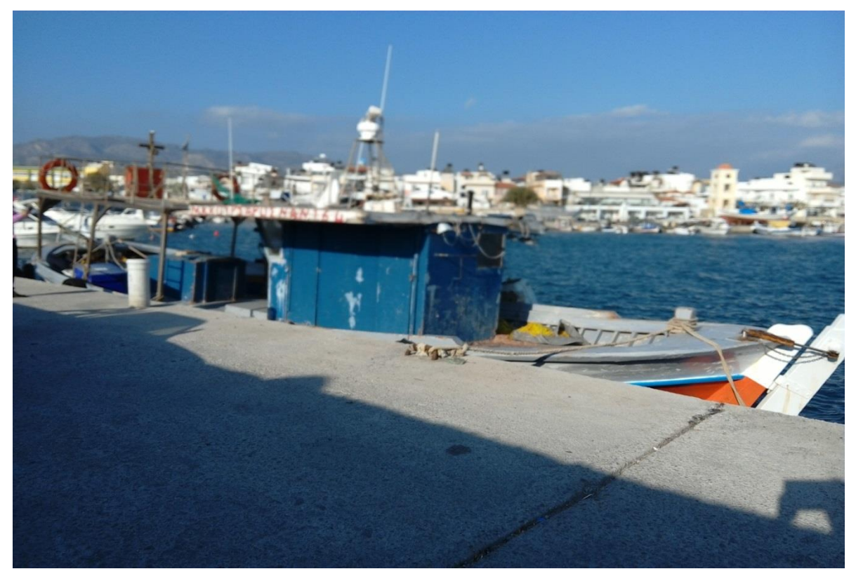
Greece : Rosetta Case

smuggling of tobacco products. With regards to the first case (Rosetta), a total of 11 799 420 packages were discovered amounting to 2 359 624.014 Euro of duties evaded and, in relation to second case (Zahra), a total of 33 260 000 cigarettes were found which evaded duties amounting to 6 086 007.87 Euro. The French customs authorities intercepted two containers at the port of Le Havre and identified 1 400 boxes of 50 cartons of smuggled cigarettes which were not authorised to be sold in the EU and were clearly intended to exclusively supply the parallel and illegal market.