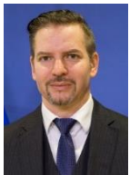
Mr Petr KLEMENT Committee member until 1 September 2020

General Secretary of Internal Security System, Portugal. Public prosecutor.